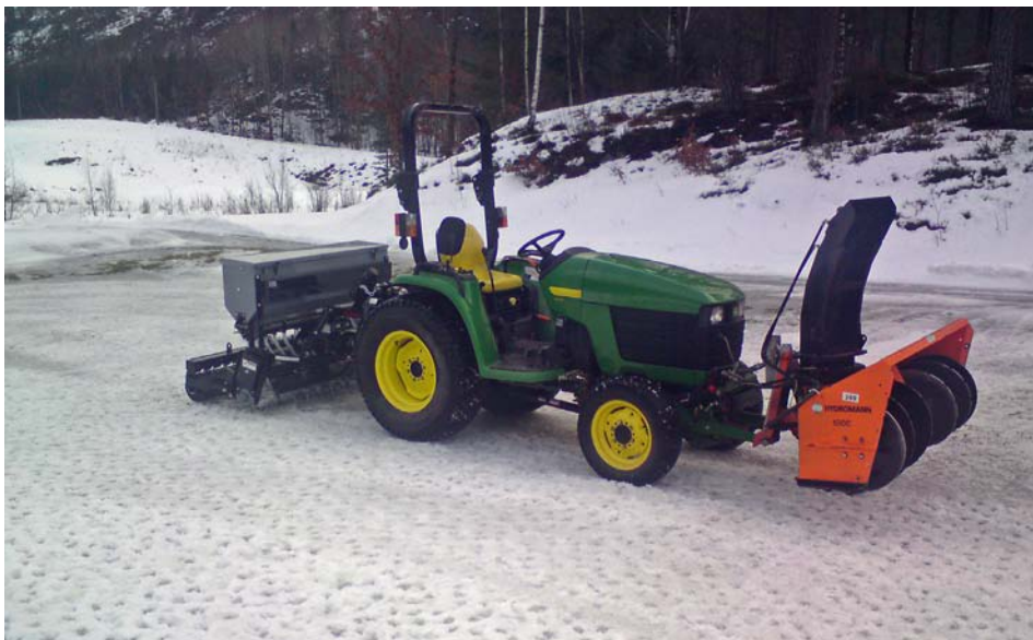
Front mounted rotary snowblower, here combined with a vibrating aerator that is suitable for ice cracking.

Early melting of the snow may expose the turf to low temperatures and other spring stresses. See the fact sheet "Spring stresses".