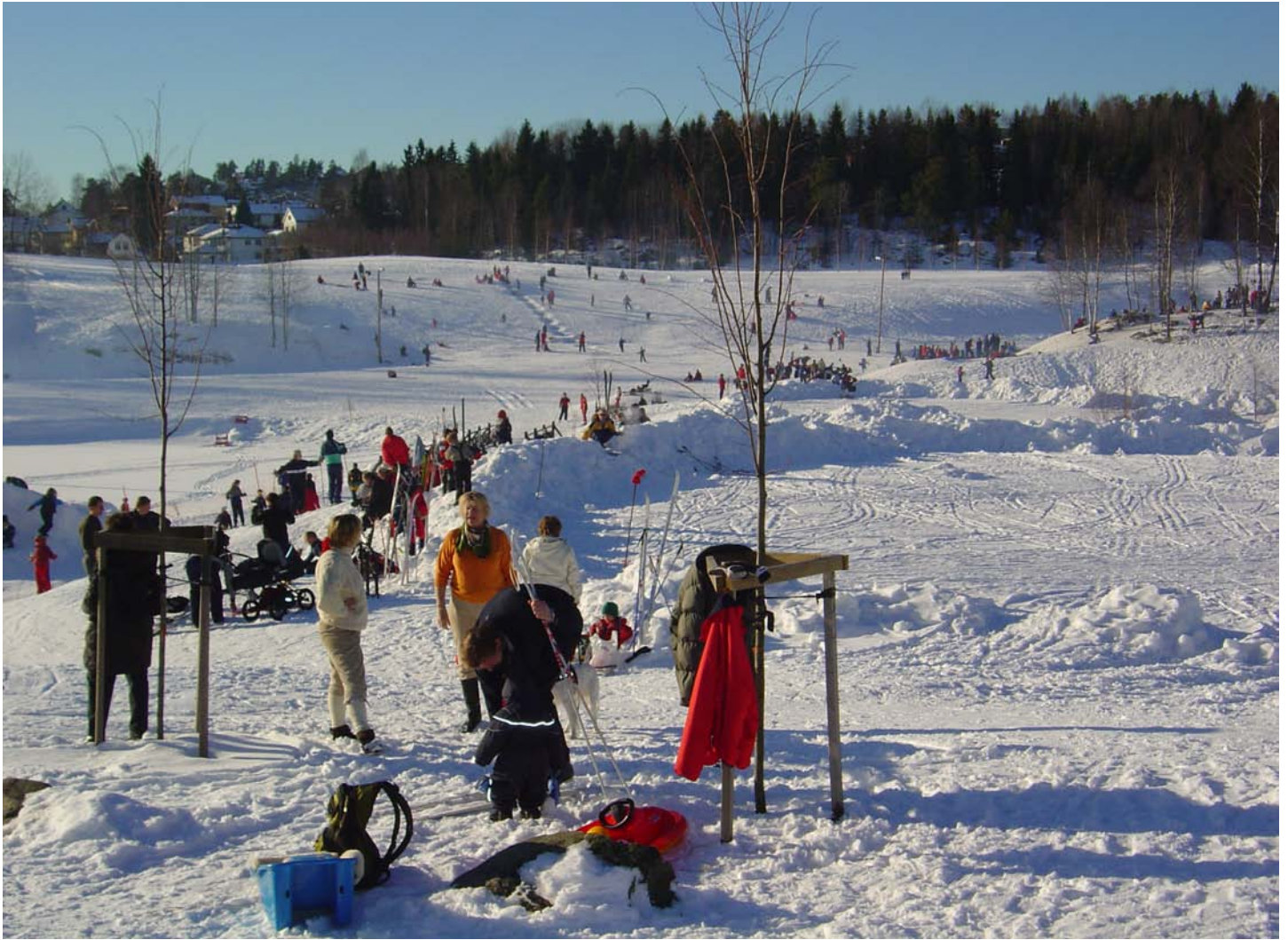
The public often have access to Nordic golf courses during winter. Picture is showing Oppedgård GC on a Sunday in March.