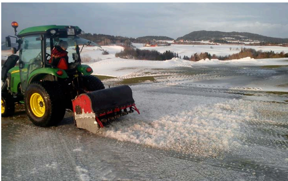
An old aerator used for ice cracking on a golf course in Trondheim, Norway where ice causes big challenges almost every winter.