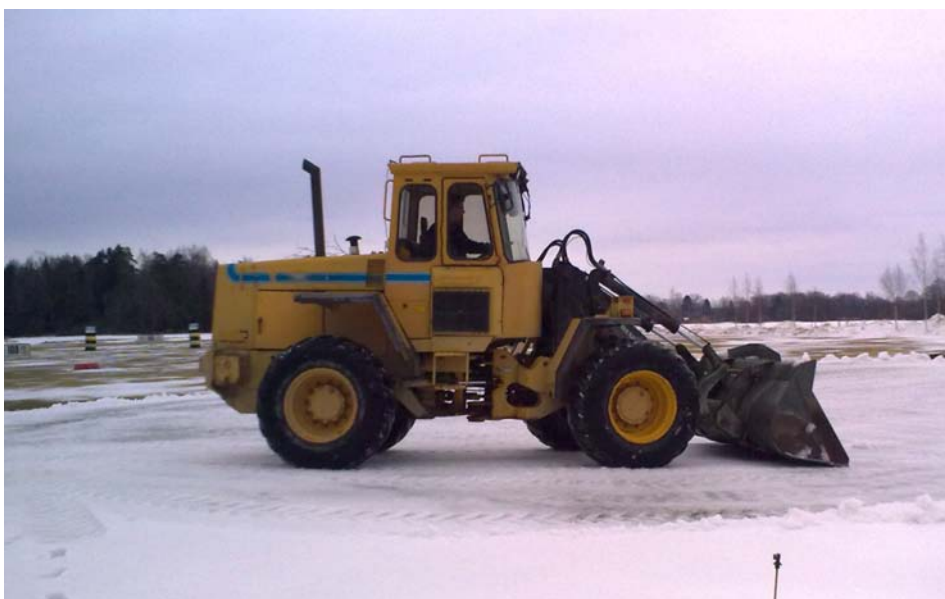
A tipper truck is not the most common machine on greens, but it can be used if the ground is deeply frozen.

On locations where huge amounts of snow are rare, it can be difficult to find suitable equipment for snow removal. The kind of tools that should be used is depending on the ground's carrying capacity and how exposed the plant crowns are. When the greens are frozen they can carry heavy machinery, but a very popular piece of equipment is the front set rotary snow plough. See picture. Not all tractors