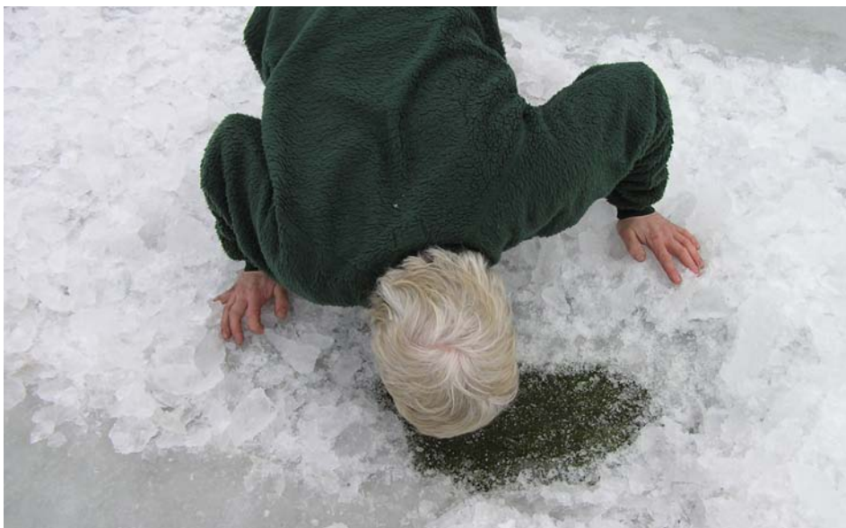
Above: A trained nose can be used to track anaerobic metabolites and evaluate the status for the turf. Below: Gas escapes through the ice and dirty water spread on the surface when there are anaerobic conditions and the soil microorganisms are active.

Information about the depth of ground frost can help you to evaluate if water will drain through the root zone, and to estimate when soil temperature can be expected to increase in spring.