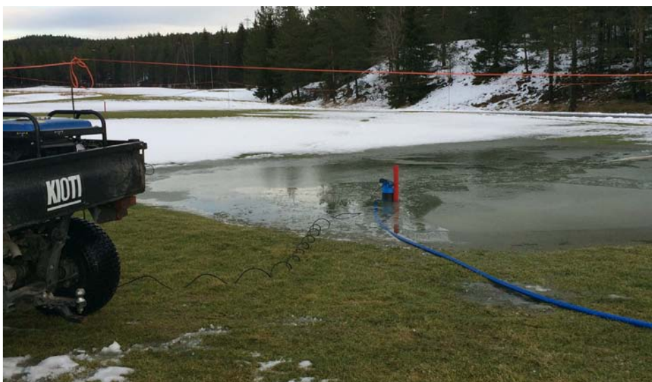
Melting water can cause problems during the winter. A portable pump can be useful for reducing ice encasement. Photo: Allan Ferm, Grønmo GC, Oslo. 28 January 2016.