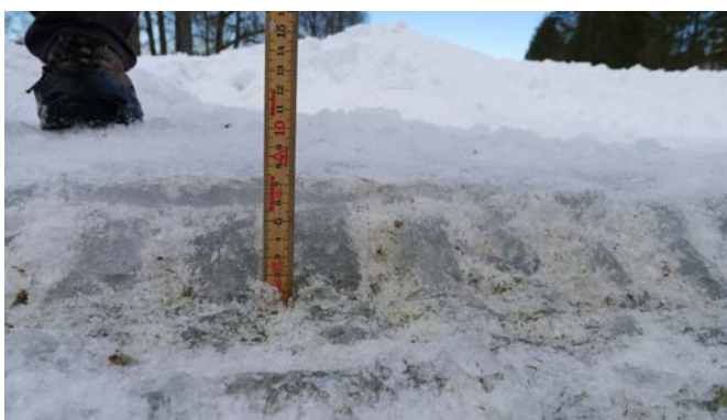
Under a snow cover 7 cm of solid ice had formed on top of this green. Ice with a high content of air pores is white. Solid ice is transparent.