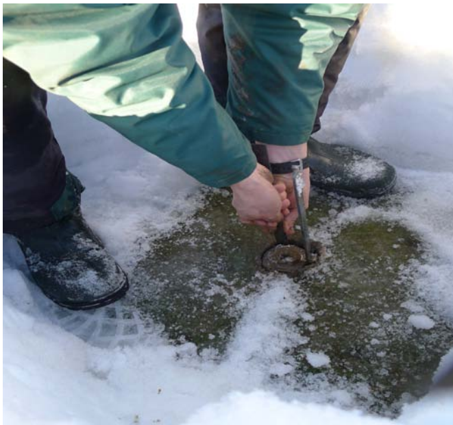
Sampling plant material from greens is not easy. Here we found slush between the snow and the frozen root zone.

Ice can form under snow during rain or from melting snow. The only way to monitor this is to dig down to the green surface and check the thickness and quality of the ice visually. Read more about ice quality in the fact sheet "When to break the ice".