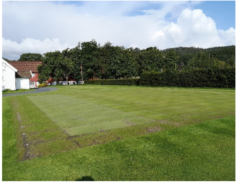
Figure 2. Sowing at Landvik (1-2. July) and the established green 6 weeks later.