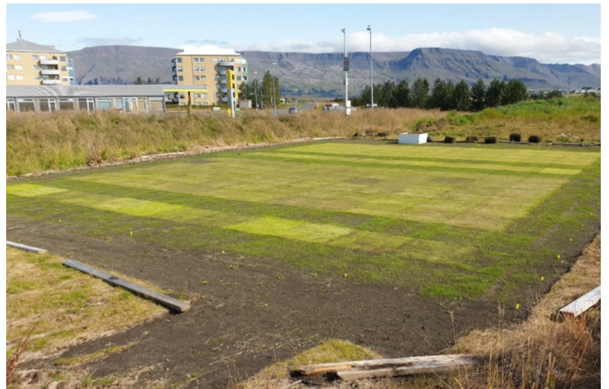
Figure 3. Sowing on Iceland (6-10. July) and one month after sowing