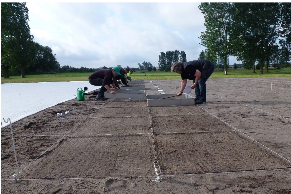
Figure 4. Sowing at Sydsjællands Golfklub, Denmark (15-19. August)