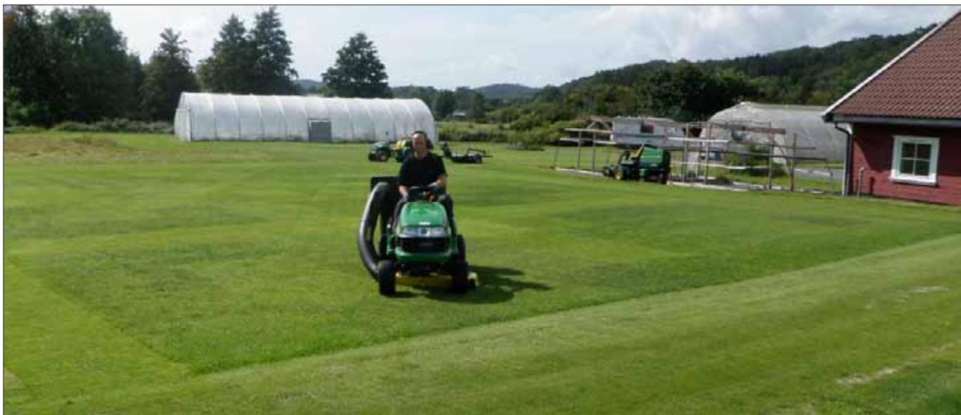
The strong fibres of the ryegrass leaves require sharp cutting knives in order to prevent peeling and grey leaf tips.

The great wear tolerance makes perennial ryegrass an important component of football turf. Where winter hardiness is important, perennial ryegrass should be used together with smooth meadow-grass.