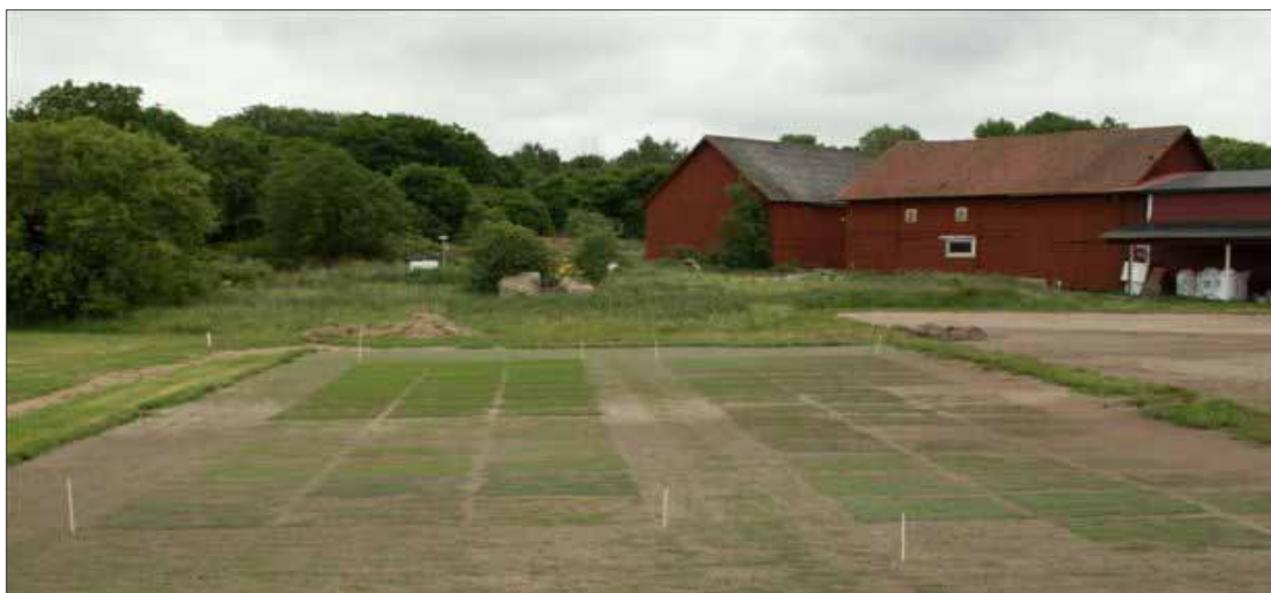
Fairway trials at Fullerö GK, Sweden, June 2008.

Seed lots of turfed hair-grass contain about 4000 seeds per gram.