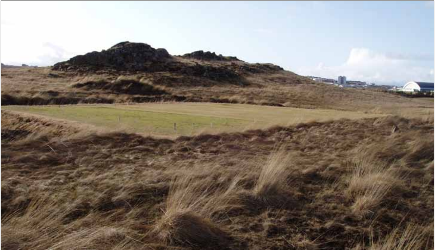
Variety testing on Iceland.