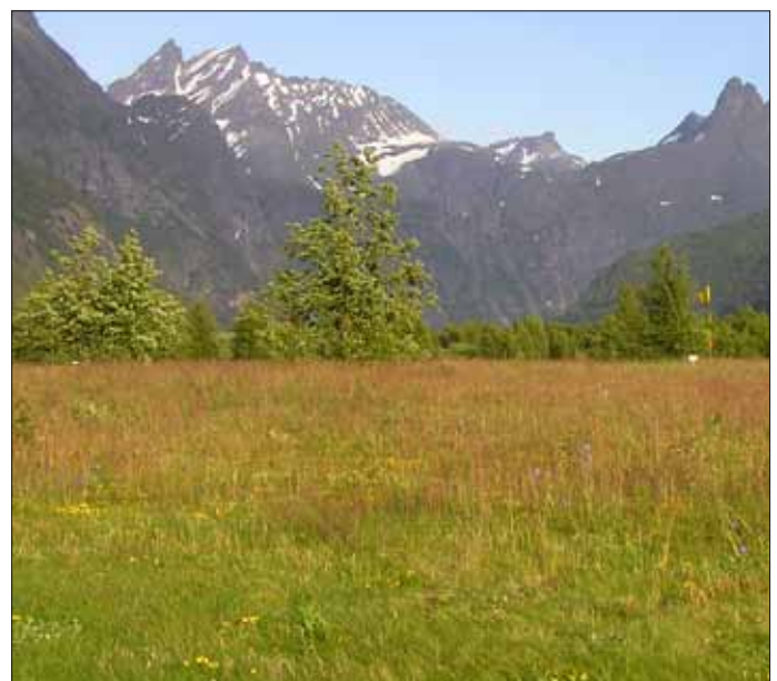
Rauma GC, Norway.

Common bent must not be seeded deeper than 5 mm. It usually germinates and establishes quickly, but like other bents, it is more susceptible to irregular water supply during establishment than grasses with larger seeds.