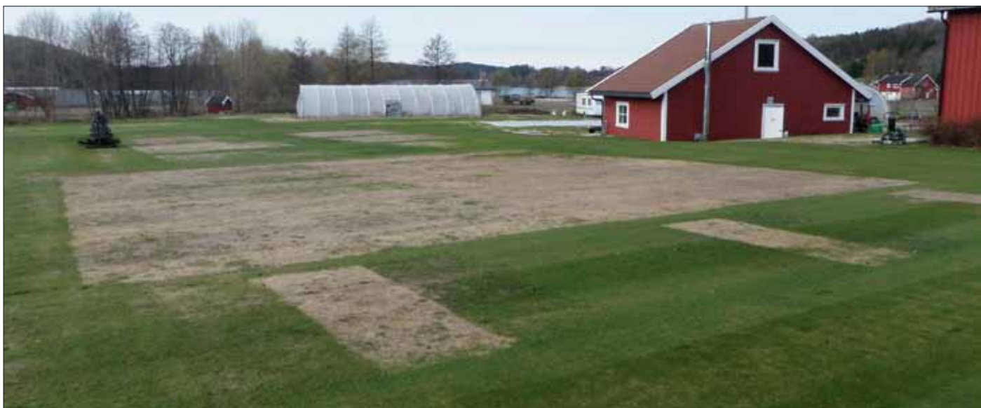
Winter damaged perennial ryegrass. Landvik, Norway, spring 2011.

Perennial ryegrass has large seeds (500 seeds per gram) and it germinates quickly and under drier conditions than most other species. The species is therefore often used in seed mixtures to repair sward damage. However, because of the negative characteristics mentioned above, perennial ryegrass should only be included in seed mixtures after careful consideration of the long-term consequences.