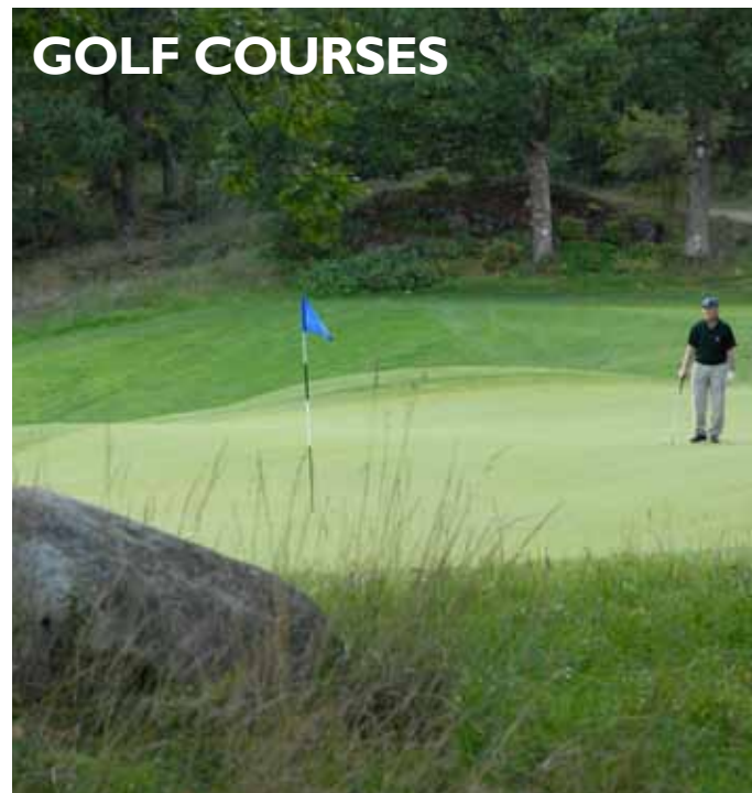
Table 2. Grass species used on football pitches and golf courses