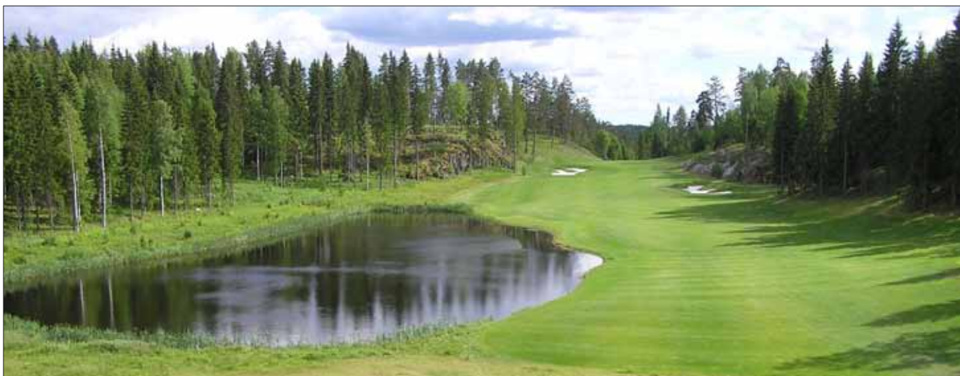
Kytäjä GC, Finland.

The seeds of velvet bent are small (15 000 seeds per gram) and the seeding depth should not exceed 2-3 mm.