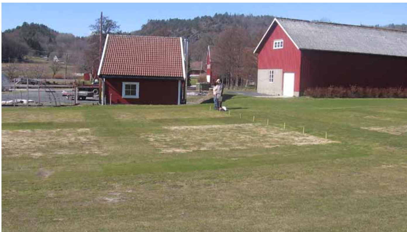
Checking out winter damages, mostly fungal diseases, at Landvik, Norway, spring 2010. From front to back: tall fescue ( Festuca arundinacea ), smooth meadow-grass (good overwintering) and ryegrasses. The partition in the middle, with good overwintering, is red fescue.

Seeds of red fescue are relatively large (600-1000 seeds per gram), but if water is not limiting, the establishment rate usually is lower than for the bents.