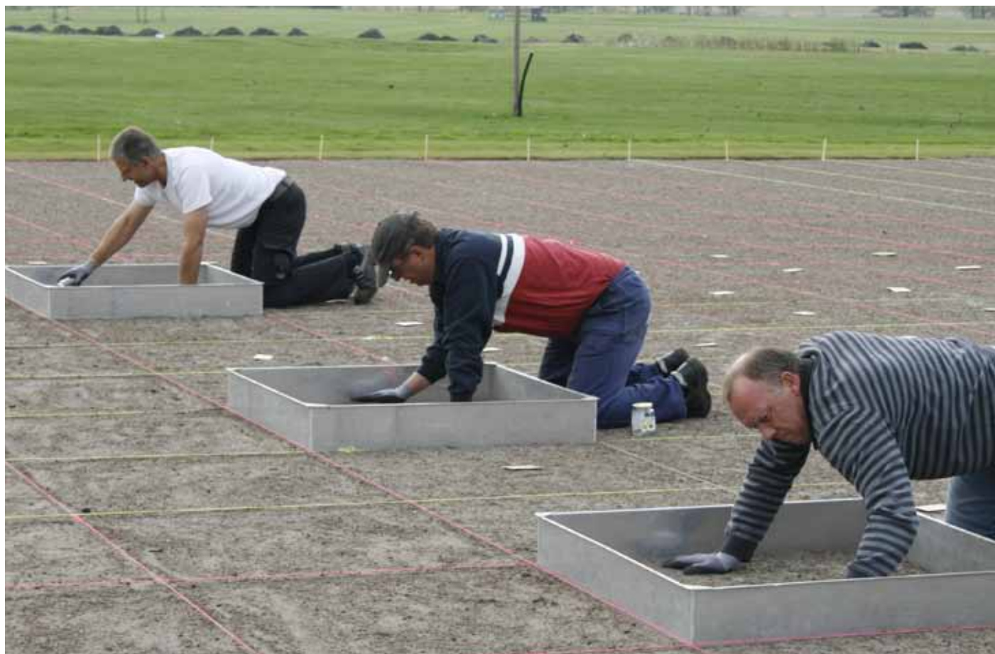
Seeding of test fields i Denmark, September 2011.

winter hardiness: ability to tolerate winter stress. There are many reasons for winter damage. Characters for winter hardiness summarize experiences over several years, whether damage is caused by low temperature, prolonged snow cover, desiccation, water, ice, or winter diseases