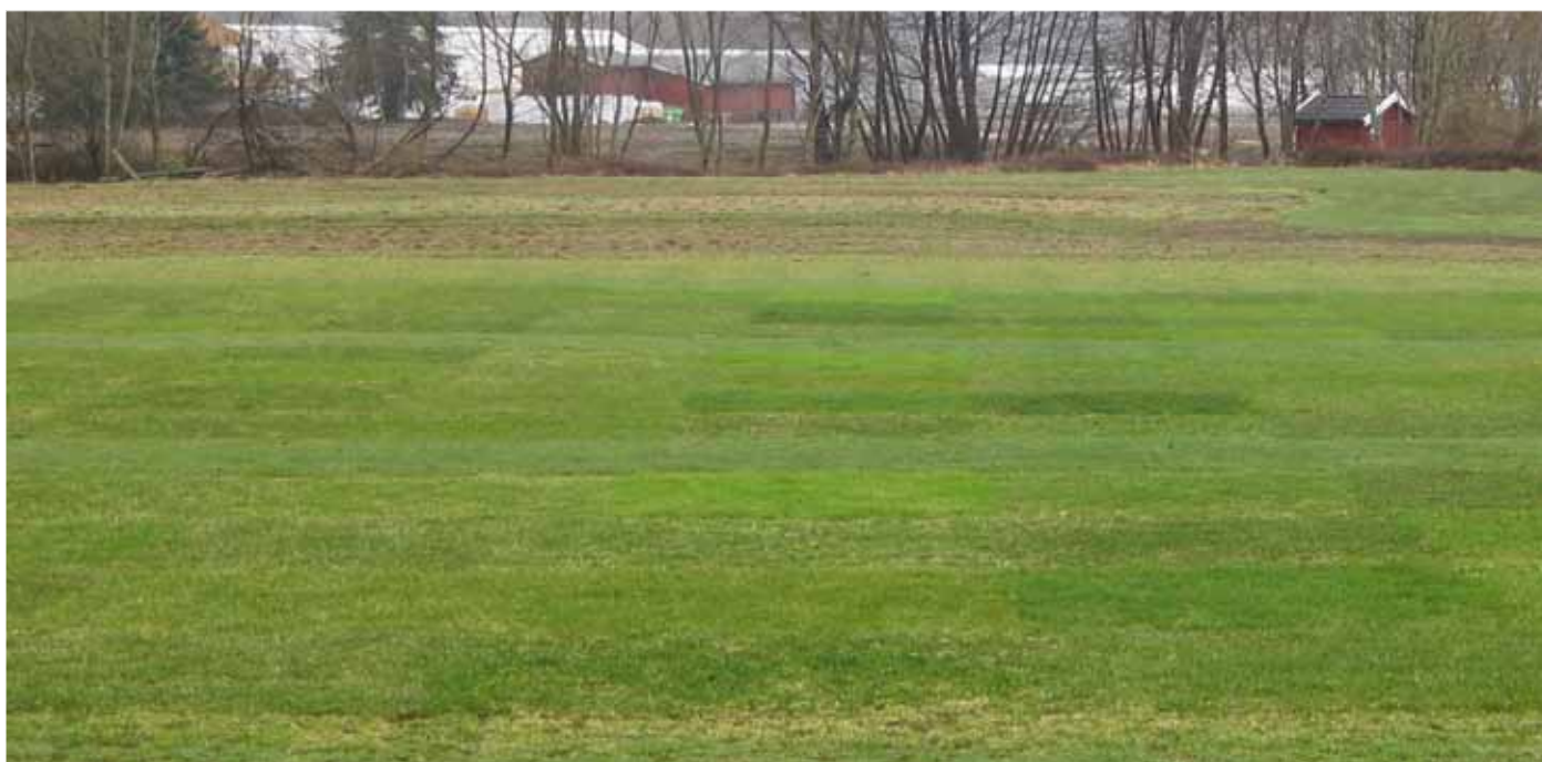
There has been a tendency among grass breeders, especially American companies, to breed darker ryegrass varieties. One of the consequences is that it is easier to spot invasion of annual meadow-grass. Landvik, Norway, 2008.

Perennial ryegrass has poor winter tolerance and will often die out in the inland of the Nordic countries. However, it will normally survive in southern areas and along the coast. It is difficult to predict where this borderline is, as the winters are so different. The genetic progress in winter hardiness had been less than for tiller density and leaf fineness, and most variety trials show only small differences in winter survival. The past decade has brought to the market some tetraploid (double set of chromosomes) varieties for which a better tolerance to turf grass winter diseases has been documented, but it remains to be established if these varieties are also stronger against physical winter damages such as freezing temperatures, desiccation or ice encasement.