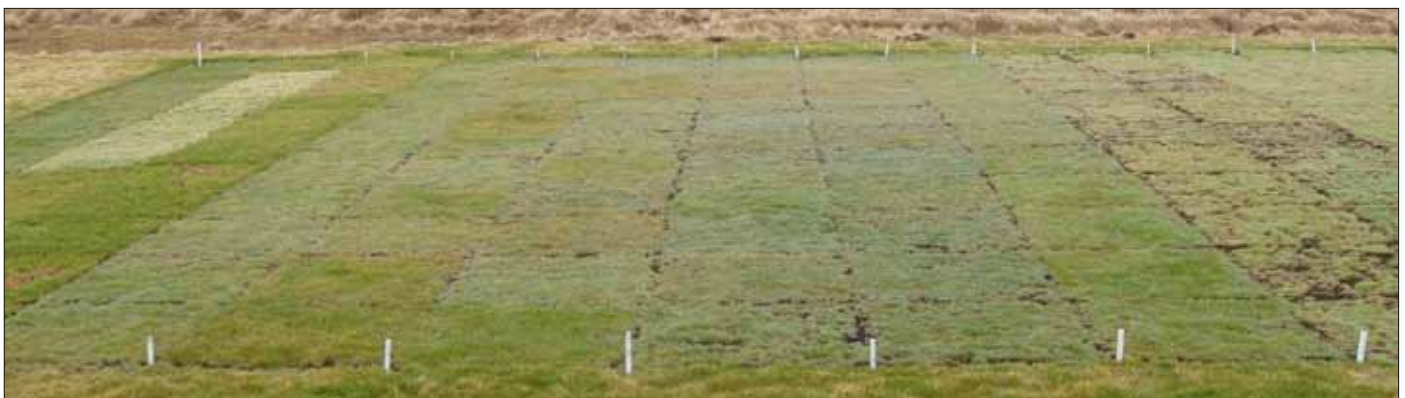
Variety testing on Iceland.

Creeping bent is rarely seeded in mixtures with other species in the Nordic countries, but it is common to use a blend of different creeping bent varieties with uniform colour and leaf fineness.