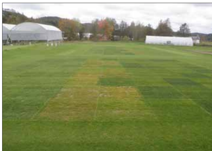
Many varieties of smooth meadow-grasses are attacked by rust in damp coastal climates. Landvik, October 2011.

Smooth meadow-grass can be used in private lawns and parks where good winter hardiness is important and it should be used on sports grounds where the recuperative capacity and wear tolerance are of great importance.